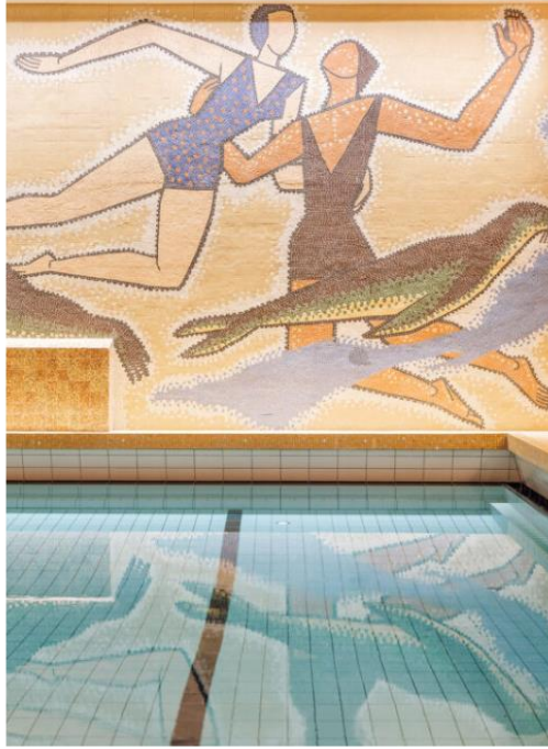
Per Krohg mosaic