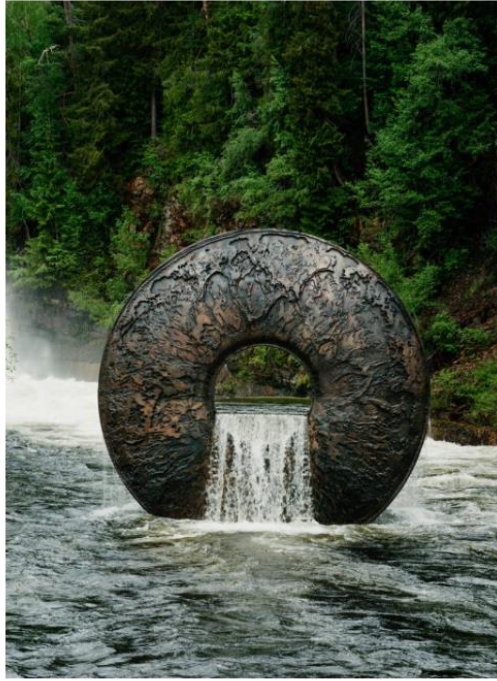
All of Nature Flows Through Us by Marc Quinn at Kistefos Sculpture Park.