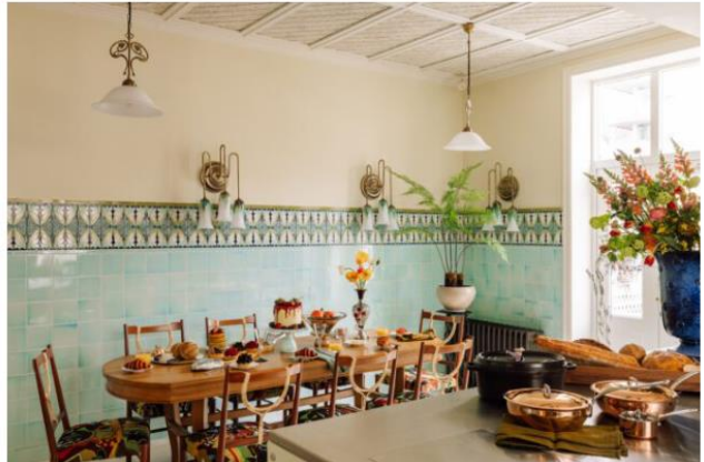
Villa Inkognito's kitchen

You're welcomed by the Lady of the House, who is on-hand to help with every need, no matter how small, before stepping inside to discover several opulent living rooms, an open kitchen, an intimate bar named Spectre (with a dedicated barman and Tattinger always on ice), and a quaint conservatory – all featuring magnificent antiques, original artwork and classic Scandinavian furnishings. It's private, yet Inkognito guests needn't feel limited to the villa as an interconnecting bridge accessed on the third floor provides a secluded entrance to Sommerro so guests can, quite literally, have the best of both worlds.