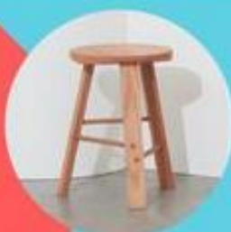
Grab a seat to meet...