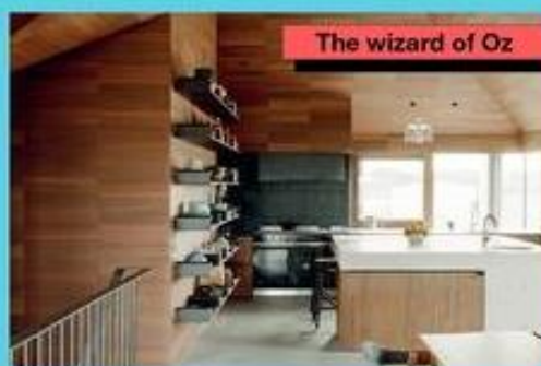
The wizard of Oz