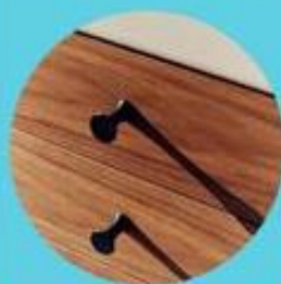
Drawers with draw

Our well-turned-out survey is brimming with positivity. Expect furniture finds, peeks through the keyhole at inspiring interiors and insights on the office of the future. We discuss getting the lighting right and sit down for interviews with five key industry leaders.