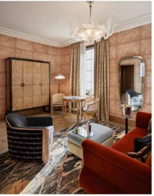
C Lars Petter Pettersen

The crown jewel of Sommerro's social spaces is its rooftop terrace, home to the contemporary Tak Oslo restaurant. The terrace's pool deck will be an exclusive retreat for hotel guests, where light bites will be served in the summer and, during the colder months, in-sauna treatments can be enjoyed. The hotel will also feature Lysverker Scene, a 200-seat gilded theatre hosting intimate events open to the public. Vestkantbadet, one of the few public baths left in all of Norway, has been brought back to its former glory and expanded into an 8,000ft² underground wellness space – the largest of any city hotel across the Nordic countries. Open to guests and the public, the wellness space will include a series of treatment rooms, restored Roman baths, a gym with an infrared sauna, and cold plunge pool offering a traditional Nordic thermotherapy experience, all with eco-friendly spa products.