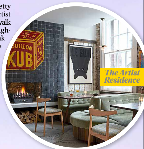
The Artist Residence